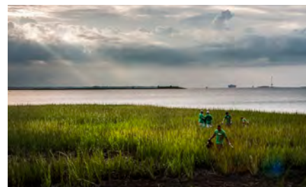
Globemaster III from the 437th Airlift Wing at Charleston Air Force Base, S.C., performs a combat landing during an incentive flight recently (top). Airmen volunteer to cleanup the marsh at Waterfront Park for trash and debris carried in from the ocean (bottom).